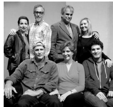
The cast of Becky's New Car

For up to date info about Kentwood Players visit our website www.kentwoodplayers.org