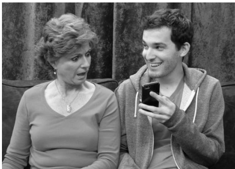
"This is my new girlfriend, Mom!"