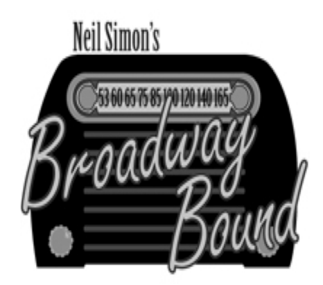
Brighton Beach Memoirs

If you are a season subscriber and are interested in attending Broadway Bound , tell the Theatre Palisades Box Office that you are Kentwood subscriber to receive a $2 savings off the ticket price.