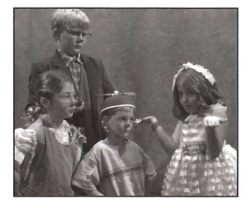
Just what did the Judge decide? See the play and find out!