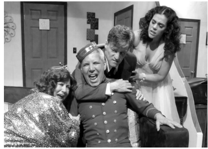
Help! I'm getting wrinkled!