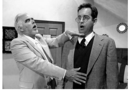
Tito tells Max, "You gotta relax."