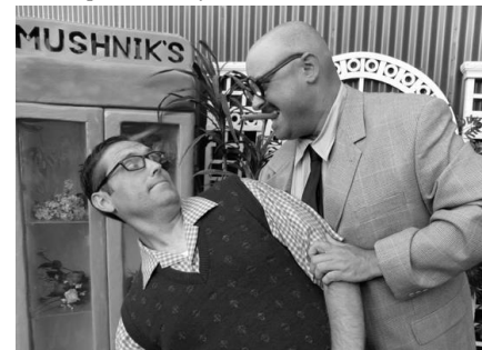
Mushnik persuades Seymour to accept an offer he can't refuse in "Mushnik and Son."