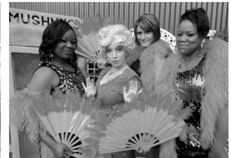
Ronnette, Crystal and Chiffon convince Audrey she deserves a better life... with Seymour.