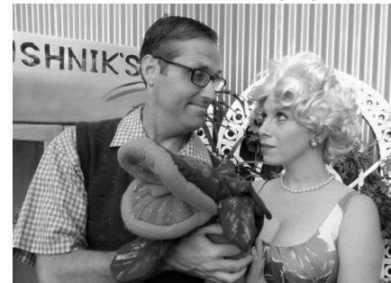
Audrey has new respect for Seymour after his plant, Audrey II, makes him a media star.