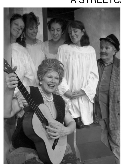
THE SOUND OF MUSIC