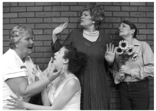
A STREETCAR NAMED DESIRE