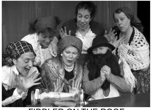
FIDDLER ON THE ROOF