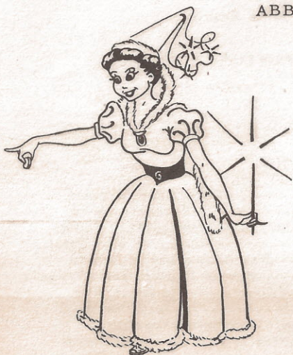
'GLINDA THE GOOD'