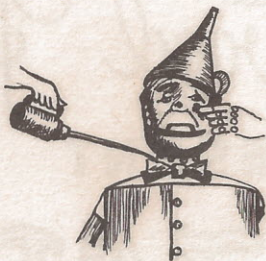
'THE TIN WOODMAN'