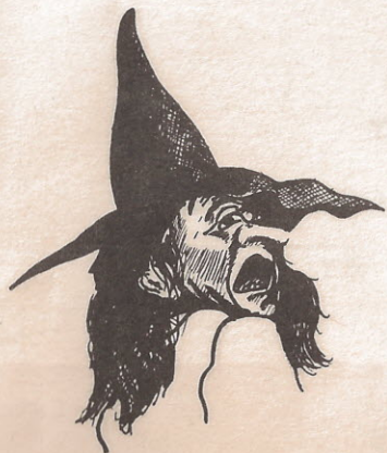
'WITCH OF THE WEST'