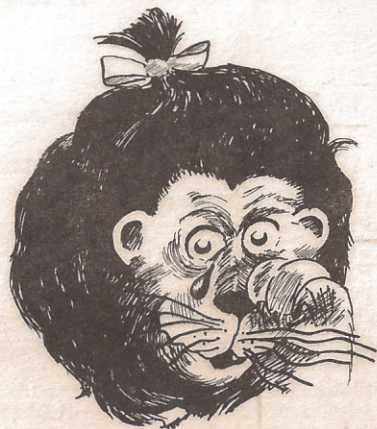
'THE COWARDLY LION'