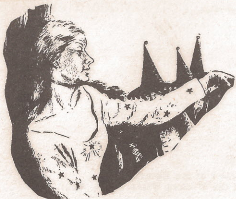
'WITCH OF THE NORTH'