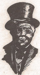
'THE WIZARD OF OZ'